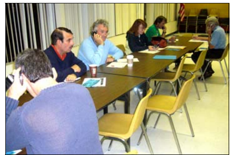
BCDC members calling voters at the October meeting.