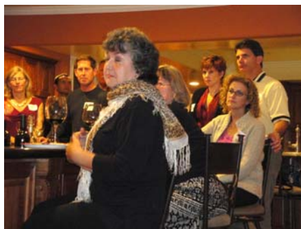
A scene from our successful October 27th membership party