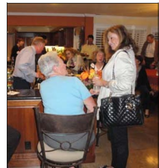
Our October 27 membership party

66 th ADDC: Our new Assembly District now includes Palos Verdes and parts of Gardena. Beach Cities has worked with Torrance, Gardena and PV Dem Clubs to form a new organization – the 66 th Assembly District Democratic Council. A volunteer group has developed by-laws and the application to be approved as a chartered organization by the California Democratic Party. Watch for future announcements!