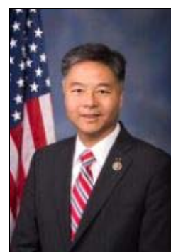
Representatives Maxine Waters and Ted Lieu, who recently spoke at the State of the Region lunch sponsored by the Torrance Area Chamber of Commerce